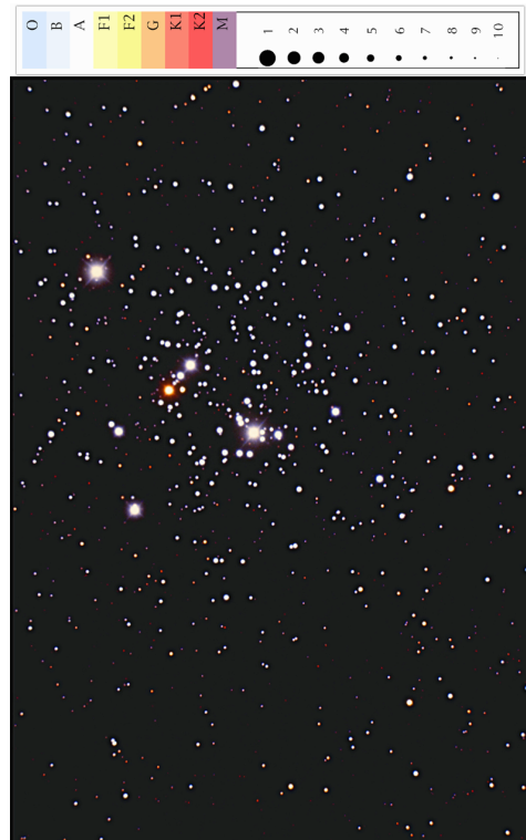
The Jewel Box Cluster. This is the picture you will be analyzing, but you must use a color version provided by your teacher.

Place a dot with your marker on the star you have just measured and then proceed in some systematic fashion to measure and mark on your chart (on the last page of this activity) the brightness and color of every star within your 4 cm square.